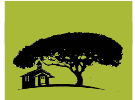
The Preschool at Kapalua