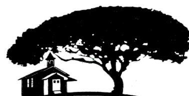
The Preschool at Kapalua